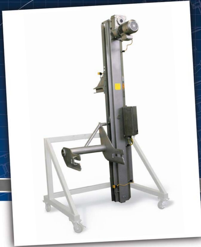
Shown with optional portable base

PrimeMove™ COZZINI MATERIAL HANDLING SYSTEMS