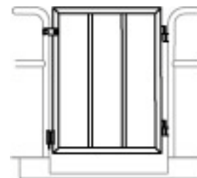
Safety gate option prevents unauthorized access during machine operation.