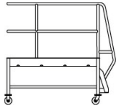
Platform with ladder and optional casters.